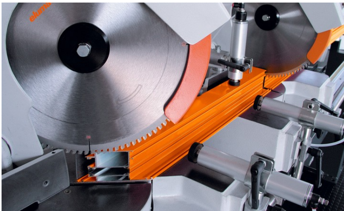
Double mitre saw DG 79