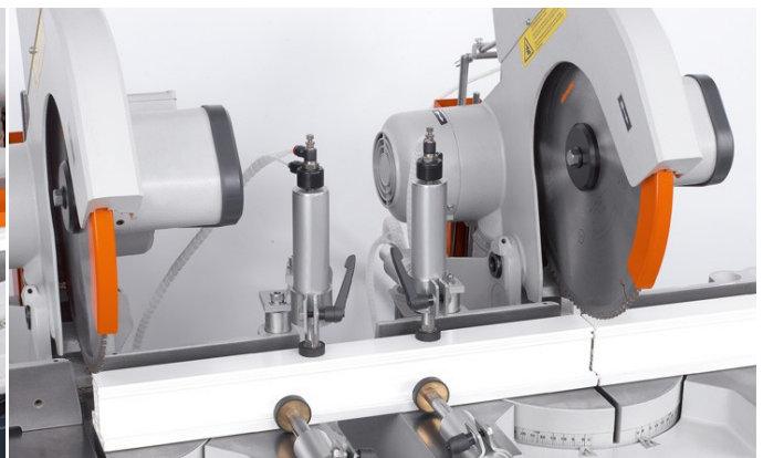
Double mitre saw DG 79