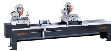
Double mitre saw DG 79 M