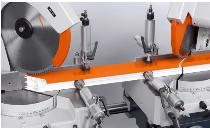
Double mitre saw DG 79