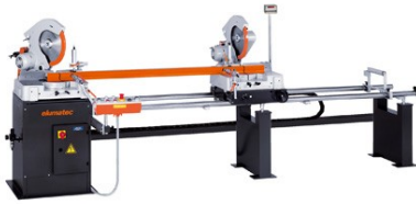
Double mitre saw DG 79